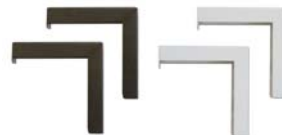
ZVMAXLB6-B: Black 6" L Bracket Set ZVMAXLB6-W: White 6" L Bracket Set